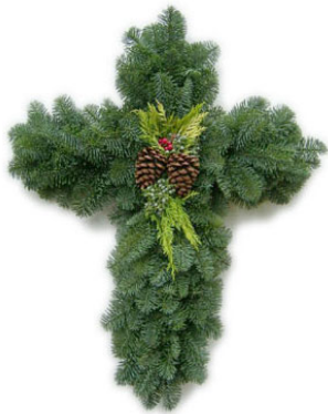
26" Cross Wreath

Popular Christmas tree with needles that are dark green or blue green and are soft to the touch.