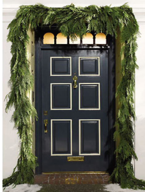
15' & 75'

Majestic Christmas tree with rich fragrance. needles have a silver green hue that stay on longer than other types.