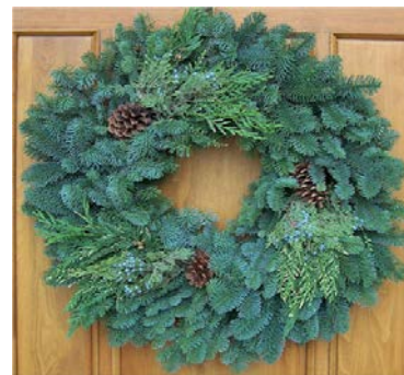
26" Decorated Wreath